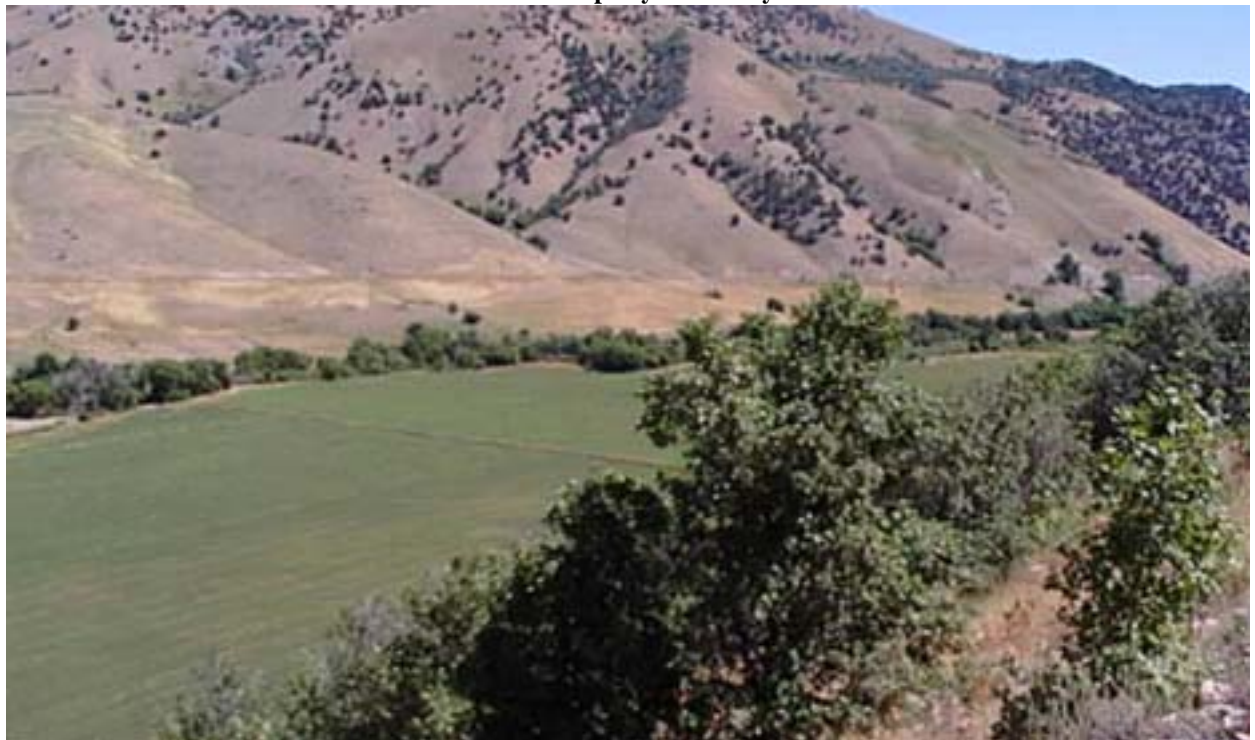
View to the East from South Plateau