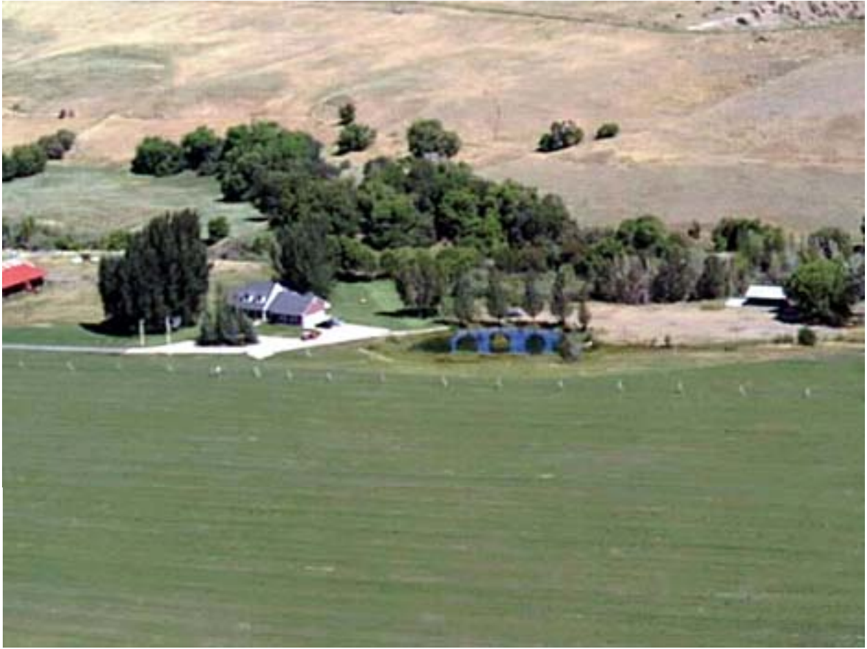
View of Ranch from the South Plateau