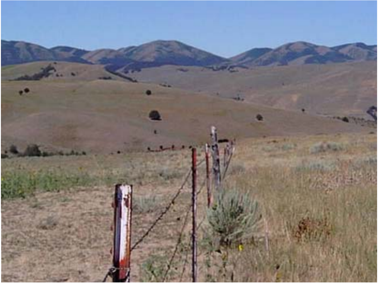
South Property Boundary