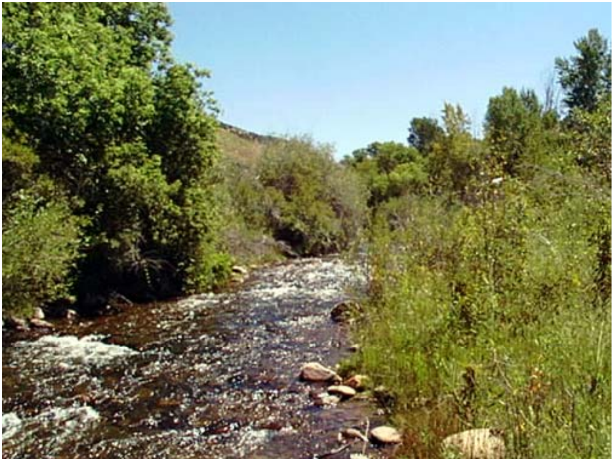
East Fork of The Little Bear River